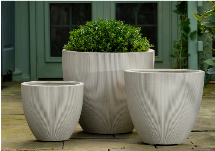
Shown in Alabaster