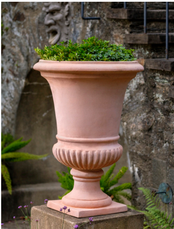
Shown in Terra Cotta