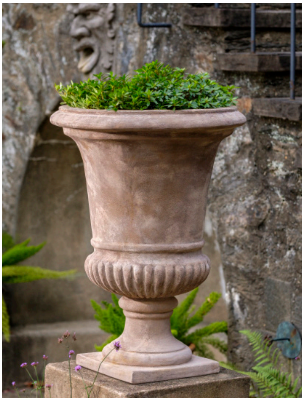
Shown in Antico Terra Cotta