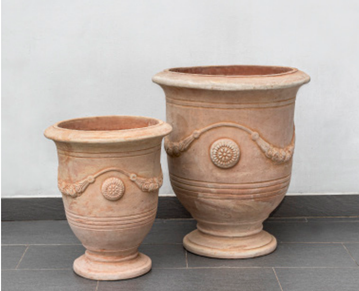
Shown in Terra Cotta

Please note that actual colors may vary slightly from those depicted here.