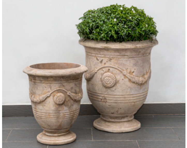
Shown in Antico Terra Cotta