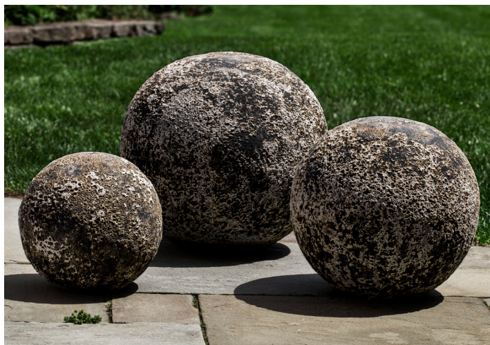
Shown in Angkor