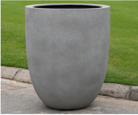
Shown in Stone Grey