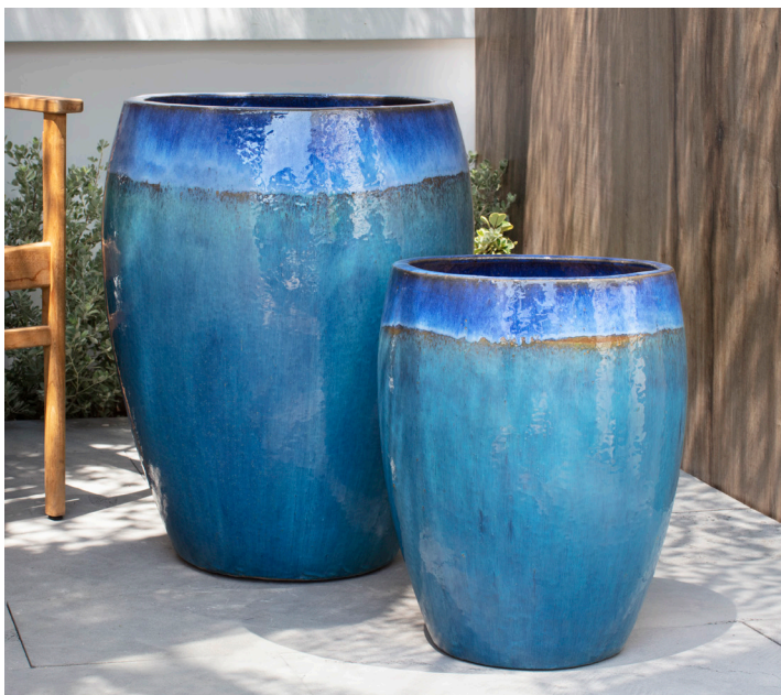
Shown in Running Blue