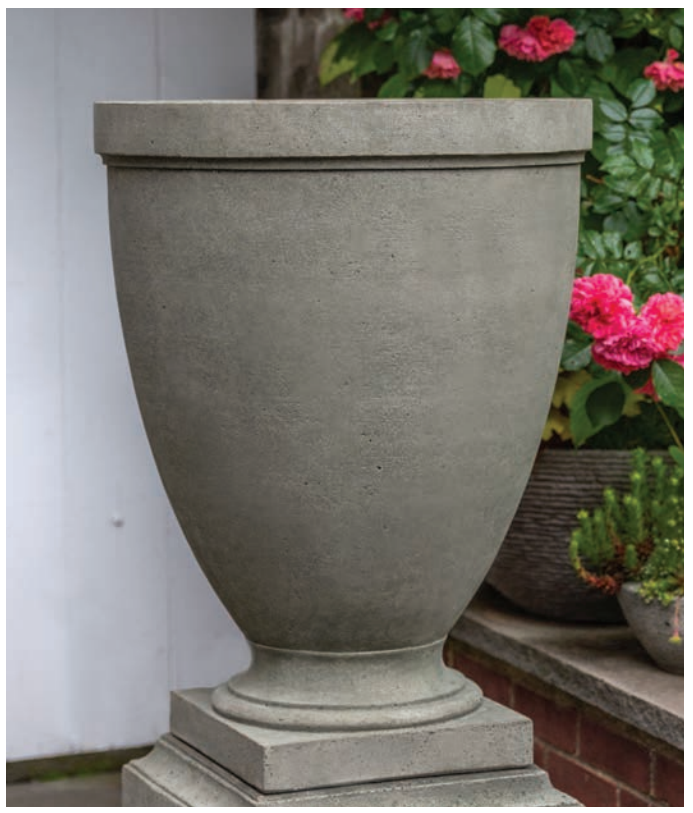
Shown in Lead Antique