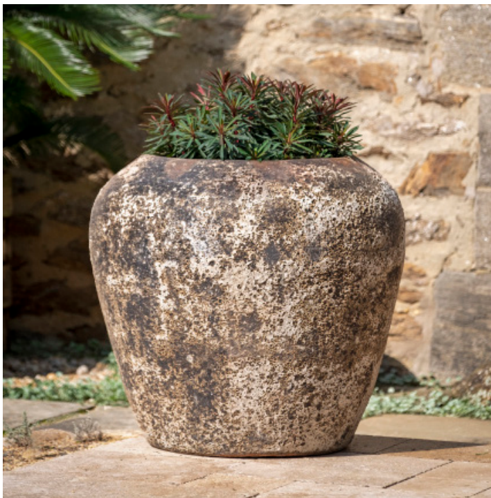
Shown in Aegean