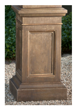
Shown in Pietra Nuova