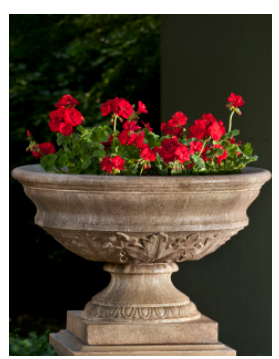
Shown in Pietra Nuova