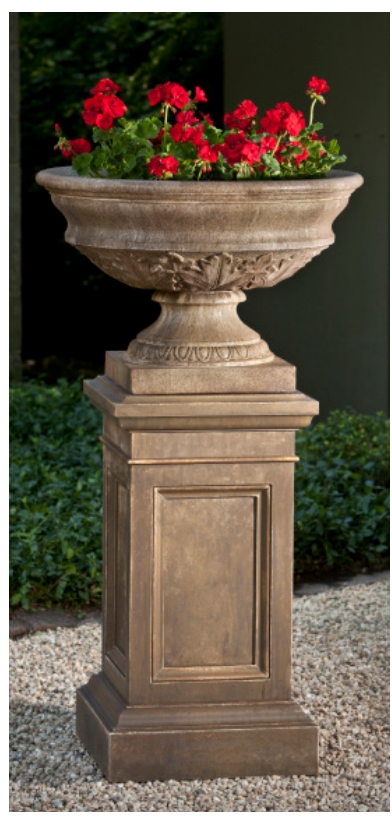
Shown in Pietra Nuova