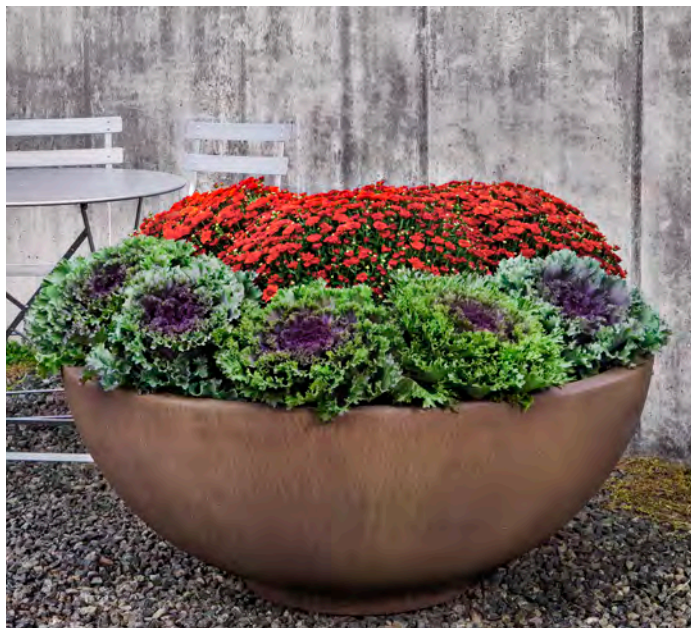
Shown in Aged Limestone