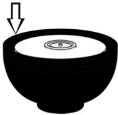
FT-396B (110 lbs) 24" Diam. x 14"H

Step 1 - Position the basin (FT-396B) where the fountain is to be installed, ensuring that it is level.