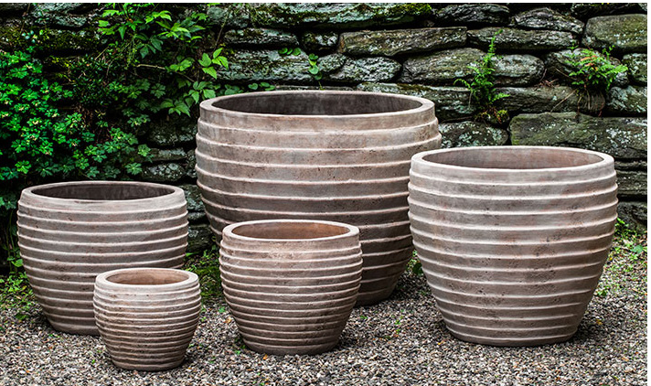
Shown in Antico Terra Cotta