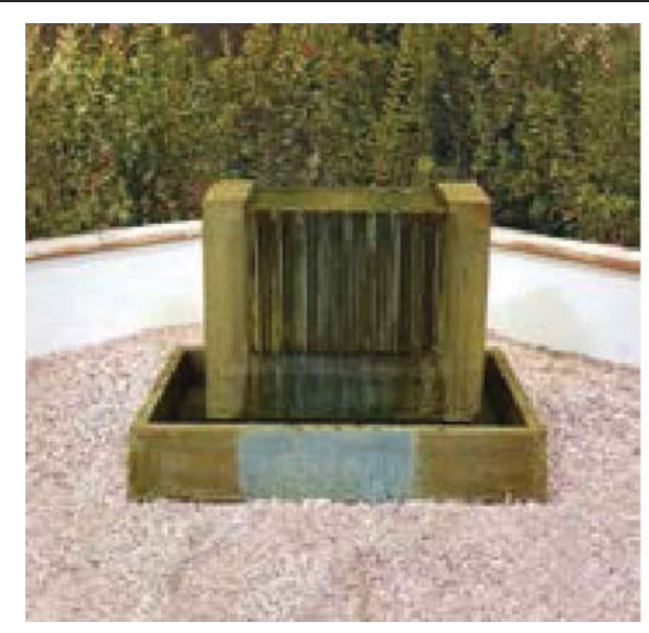
4 ASSEMBLY SCALE: N.T.S.