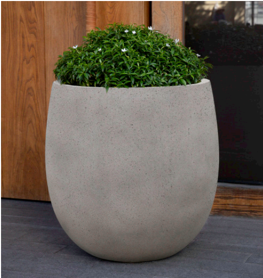
Shown in Stone Grey