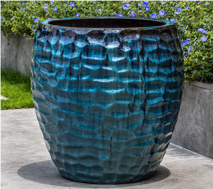
Shown in Mediterranean Blue