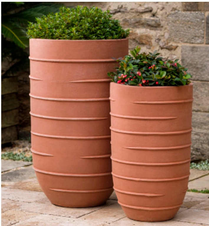
Shown in Terra Rosa