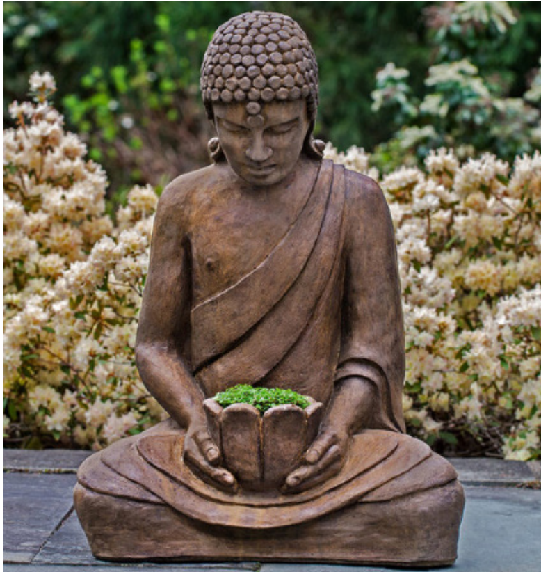
Shown in Pietra Nuova