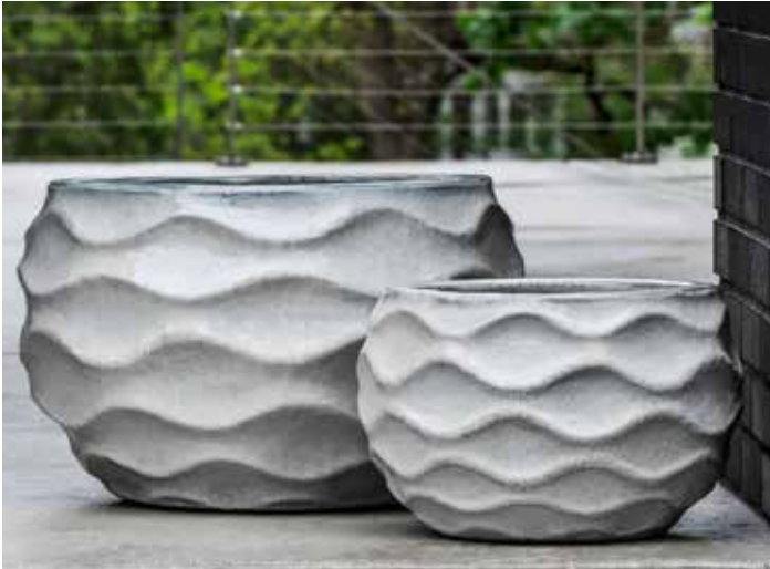
Shown in Snow