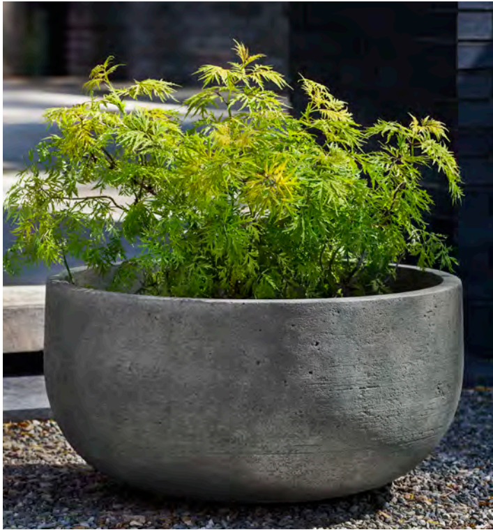
Shown in Greystone

Available in a choice of thirteen (13) exclusive natural pigment stains in addition to natural. All of our patinas are hand applied in a multi-step process which produces unique and beautiful surface finishes. Designed to replicate the look of naturally aged materials, the patinas will not prevent the natural aging process that occurs in an outdoor environment. Rather than creating uniform stains, our approach gives our products their unique beauty and appeal.