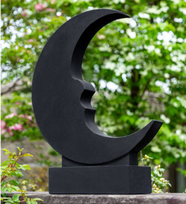
Shown in Nero Nuovo