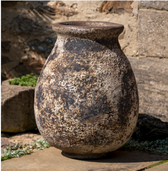
Shown in Aegean