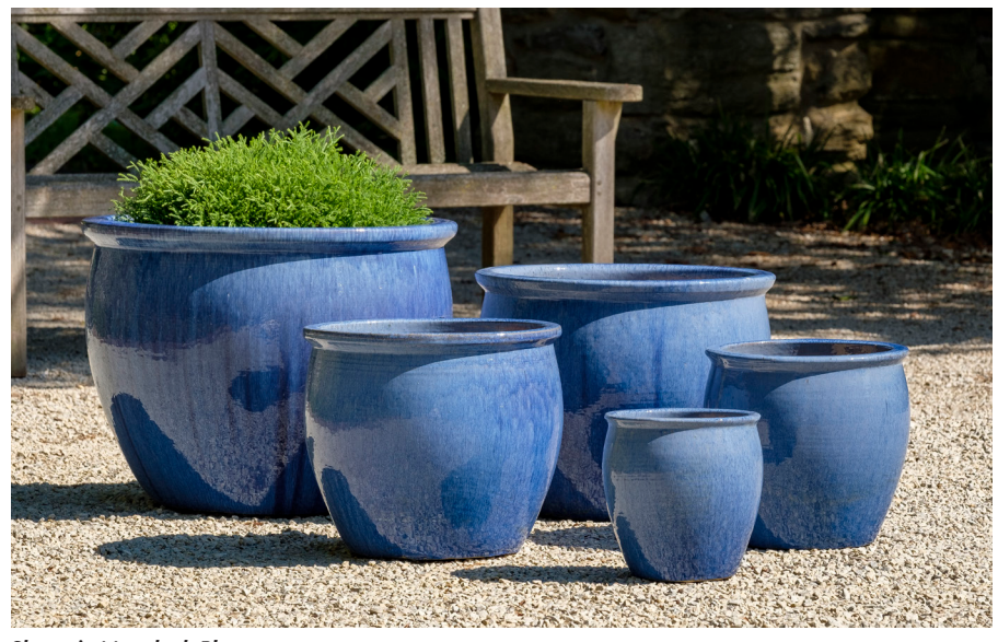
Shown in Marrakesh Blue