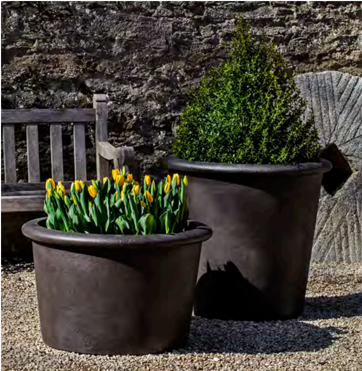
Shown in Nero Nuovo