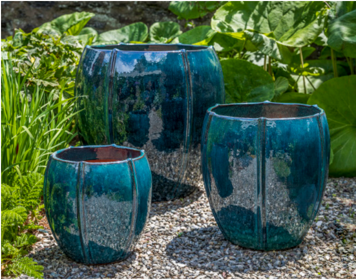
Shown in Indigo Rain