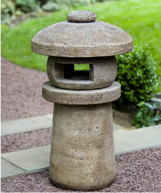
Shown in Brownstone