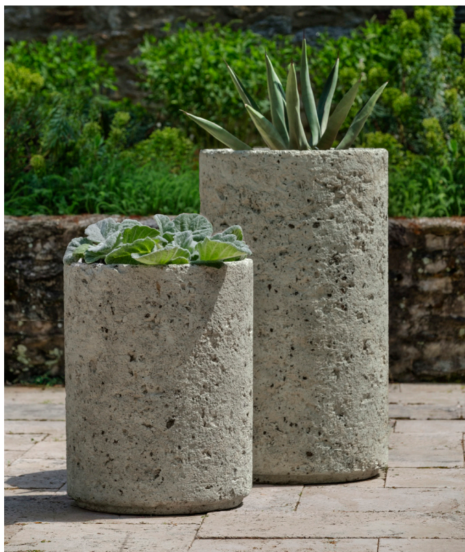
Shown in Greystone