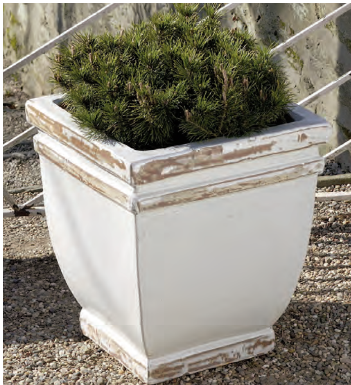
Shown in Antique White