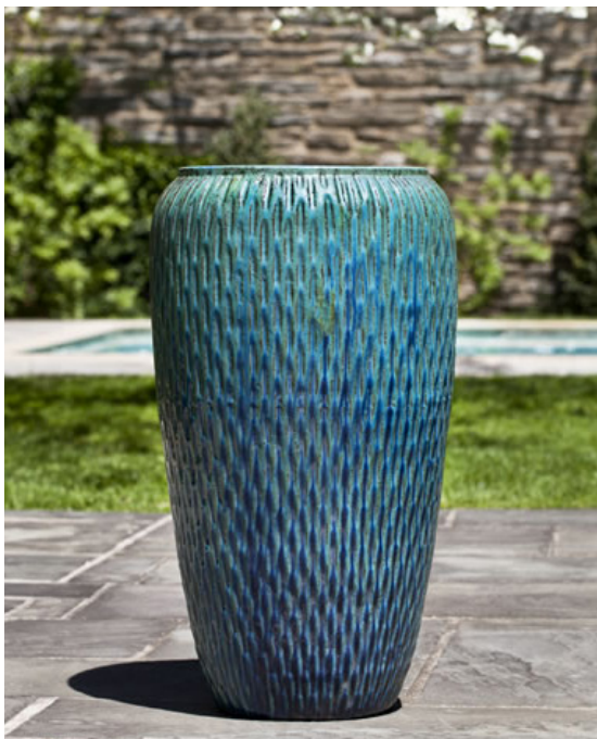
Shown in Weathered Copper