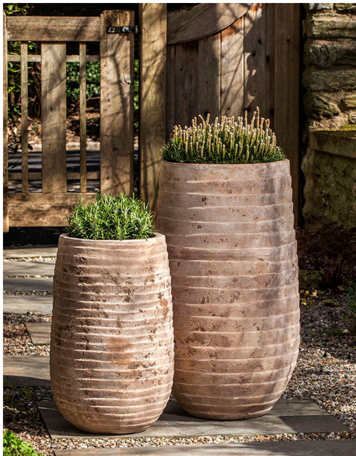
Shown in Antico Terra Cotta