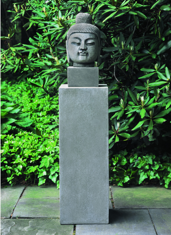
PD-154 with OR-34 shown in Alpine Stone