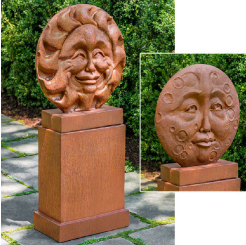
Shown in Ferro Rustico Nuovo

Available in a choice of thirteen (13) exclusive natural pigment stains in addition to natural. All of our patinas are hand applied in a multi-step process which produces unique and beautiful surface finishes. Designed to replicate the look of naturally aged materials, the patinas will not prevent the natural aging process that occurs in an outdoor environment. Rather than creating uniform stains, our approach gives our products their unique beauty and appeal.