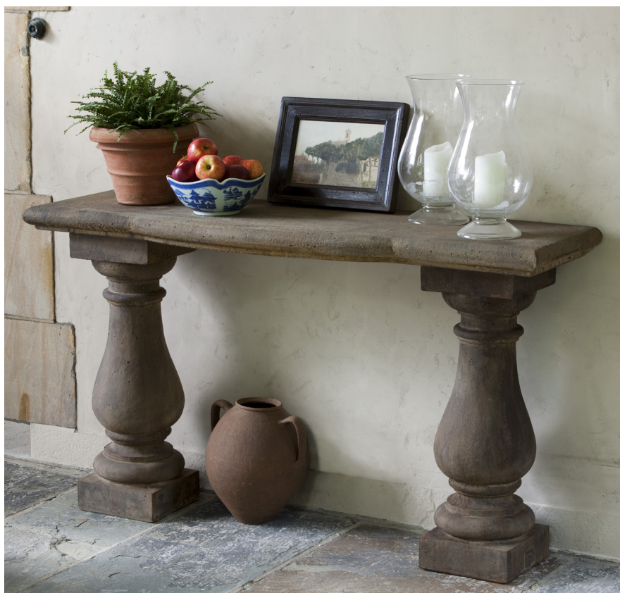
T-108 shown in Pietra Nuova