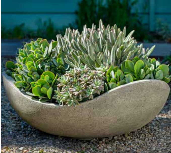
P-887 shown in Alpine Stone