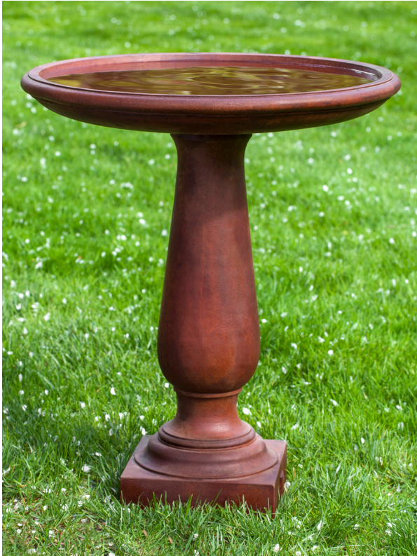
Shown in Ferro Rustico Nuovo